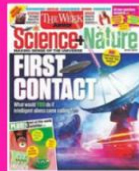
Science + Nature (print and digital available)