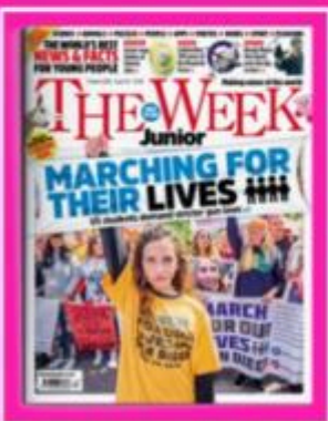
The Week Junior (print and digital available)

No one enjoys a book they're forced to read in their free time. Let young people choose to read things they enjoy & take it from there.