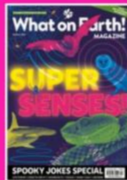
What on Earth! (print and digital available)